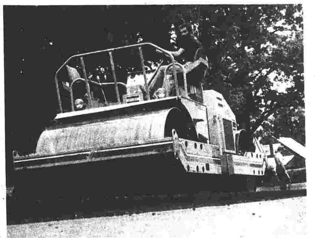
A NEW SURFACE FOR BROAD STREET ... and for some others in Manchester