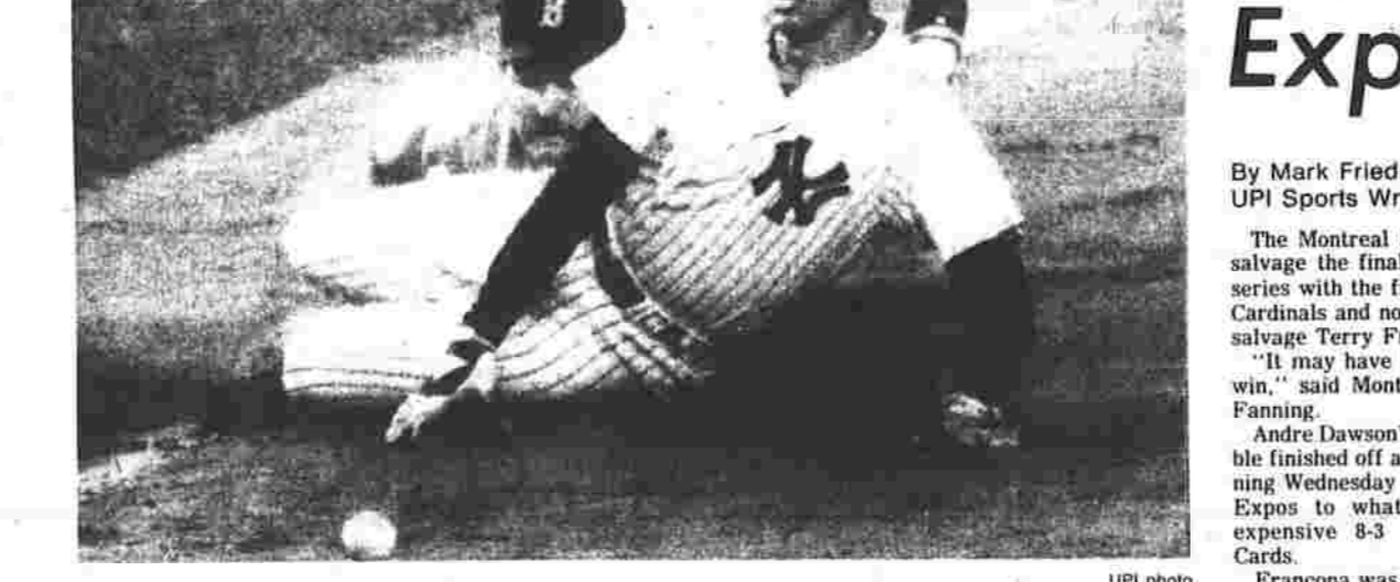
NEW YORK'S BUTCH WYNEGAR PULLS UP SAFE FOR TRIPLE WHEN BALL GETS FROM BOSTON'S CARNEY LANSDORF

NEW YORK (UPI) - New York Yankee owner George Steinbrenner said before Wednesday night's game that a victory over Boston and a resulting three-game sweep would send the Red Sox reeling.